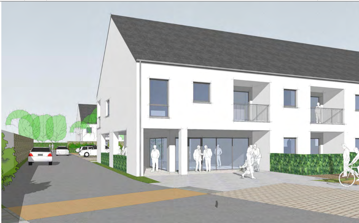
Proposed 3d View No. 4