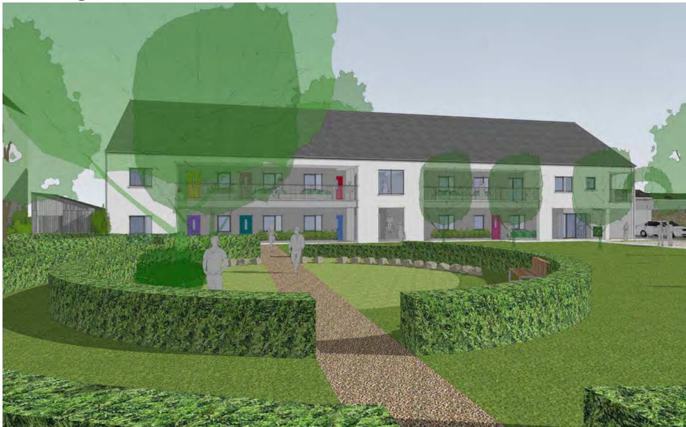
Proposed 3d View No. 6