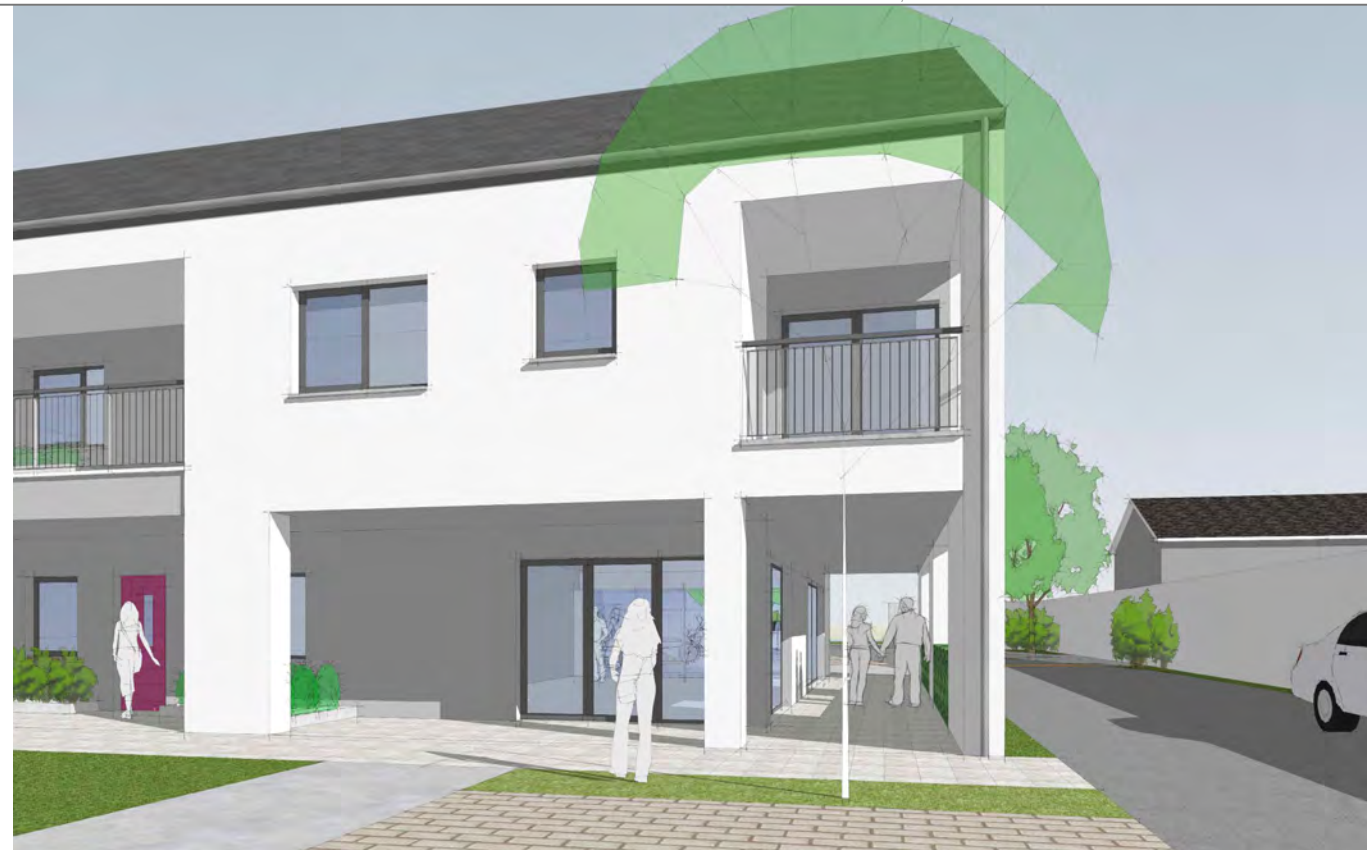
Proposed 3d View No. 5